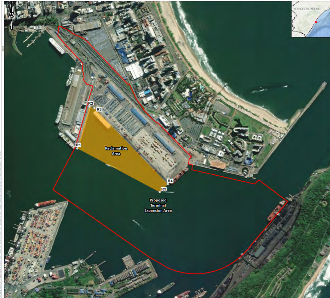
Figure 1: Map depicting Durban Port expansion in the proposed area for reclamation