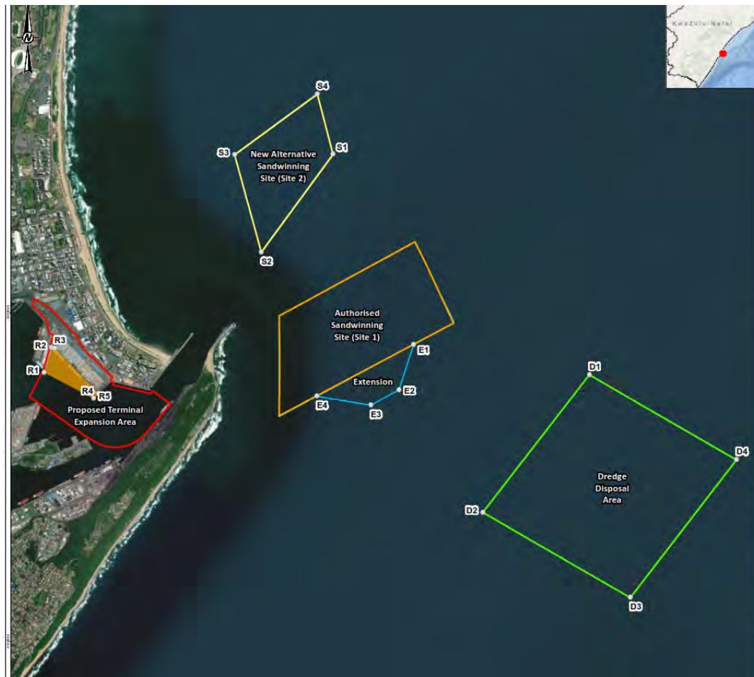
Figure 2: Proposed reclamation area in relation to sandwinning and dredging sites

TNPA operates eight ports across South Africa, playing a vital role in the country's logistics. TNPA aims to expand port capacity ahead of demand and reduce business costs to keep South Africa's economy competitive. To facilitate this, TNPA has developed the KZN Ports Master Plan. The plan focuses on reconfiguring the Port of Durban and the Port of Richards Bay to establish the Port of Durban as a Container Hub Port for international container traffic, benefiting both South Africa and Southern Africa. As part of this plan, TNPA proposes to convert areas D-G in the Port of Durban's Point Precinct into a single container terminal referred to as Point Container Terminal.